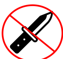
KNIVES OF ANY KIND