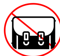
CAMERA CASES OR BAGS