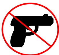
GUNS OR WEAPONS OF ANY KIND