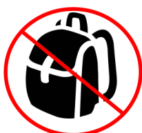
BACKPACK OF ANY KIND