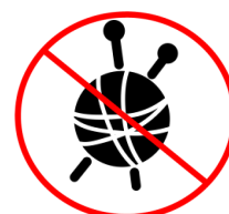
KNITTING NEEDLES OR CROCHET HOOK