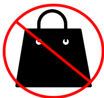
LARGE PURSE OR BAG