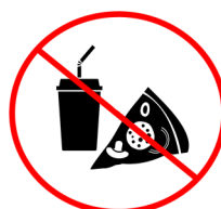
OUTSIDE FOOD OR DRINK